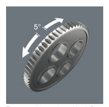
The reversible ratchet with 72 finepitched teeth has a low return angle of only 5°. This short stroke allows fast and precise work in all types of installation.