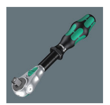
1. Fine-tooth ratchet 2. Flex-head ratchet 3. Angle ratchet 4. Quick-release ratchet 5. Power ratchet 6. Screwdriver